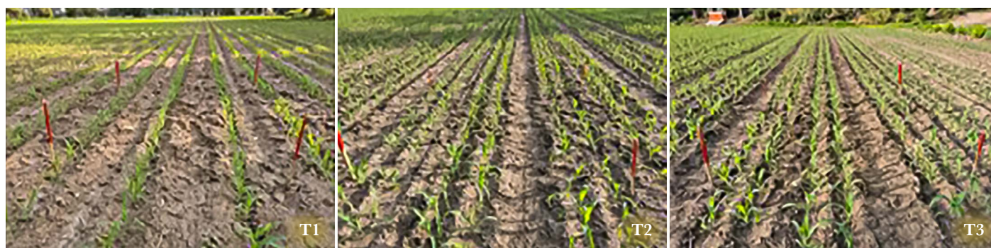
Figure 1. Corn crop evaluated at different sowing densities. T1=112,500, T2=120,000, and T3=136,000 plants per hectare.

Values with different letters in each row are statistically different (Tukey, p \leq 0.05 ). DDS=sowing density.