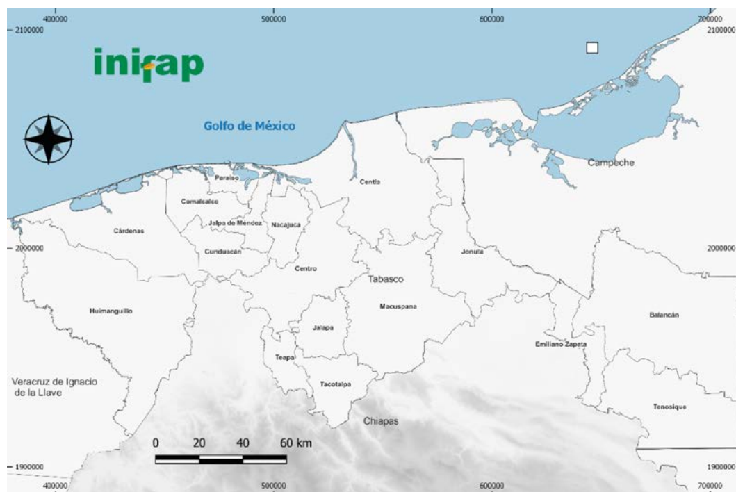
Figure 1. Geographic location of the State of Tabasco. Own elaboration with data from INEGI (2024).

is 26 °C, which due to the low altitude in relation to sea level remains constant. Annual precipitation ranges from 1800 to 3500 mm, with a dry season from April to May and a rainy season from August to October (CONAGUA, 2024).