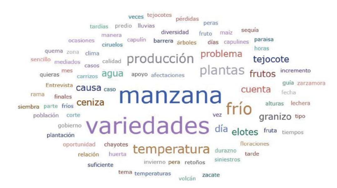
Figure 2. Word Cloud Created using Atlas.ti software.

routinely practice Amogotar with their maize (Figure 3). This technique involves cutting the grass and gathering it in different spots across the property to clear the land. The goal is to conserve soil moisture when the first rains come, as otherwise, the grass would block the rainwater from being absorbed. Additionally, this practice helps make the harvest process quicker and less physically demanding.