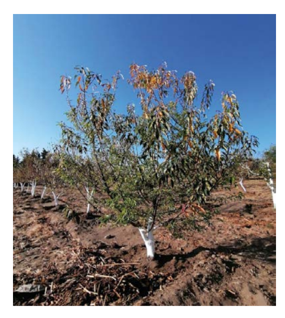
Figure 4. Formation of Cajetes around Fruit Trees.

To mitigate damage caused by excessive rainfall and strong winds, 35% of producers build live barriers (Figure 5). These barriers are made using plants such as colorín, maguey, and carrizo, among others, to prevent soil erosion and crop loss.