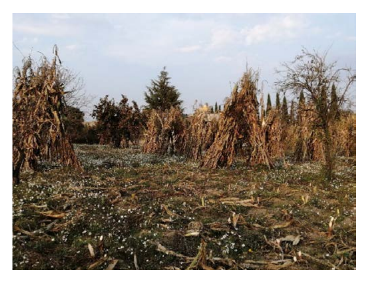
Figure 3. Amogote of Maize in San Andrés Calpan, Puebla.

Another common practice is the formation of cajetes (42%) (Figure 4). This technique involves digging a circular depression around the base of fruit trees, approximately 30 cm deep, to capture rainwater for the trees. This method helps prevent landslides and soil erosion, ensuring better water retention for the fruit trees.