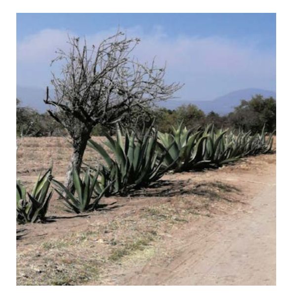
Figure 5. Live Barriers

Additionally, producers have opted to incorporate organic fertilizers (24%) instead of chemical products that harm the soil and biodiversity. In this regard, [9] López-González et al. (2020) highlight the importance of implementing agroecological practices across various management systems, as these practices support adaptation and mitigation in response to climate change.