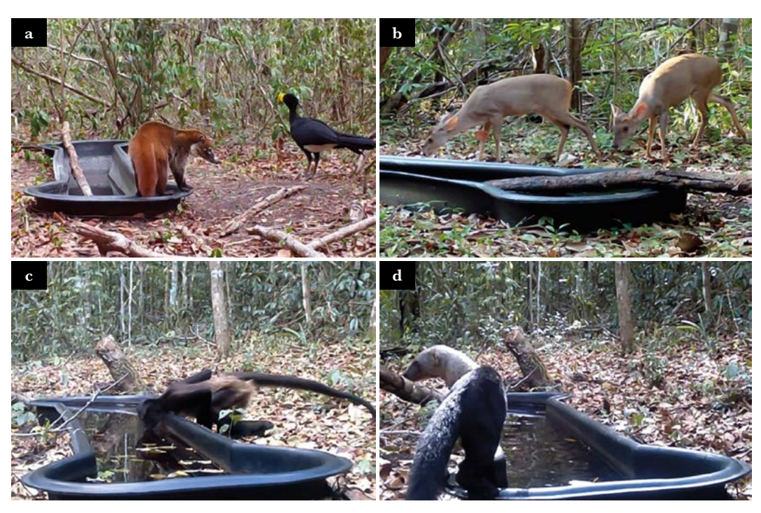
Figure 3 . The photographic record helps to identify the intra and inter-species relationships of the animals that drink from the troughs. Figure 3a shows a coati ( Nasua narica ) and a great curassow ( Crax rubra ), while figure 3b shows a pair of Yucatan brown brockets ( Mazama pandora ). Species that rarely come down to the ground, such as the Geoffroy's spider monkey ( Ateles geoffroyi ), or curious carnivores such as the tayra ( Eira barbara ), have likewise been photographed (Figures 3c and 3d).