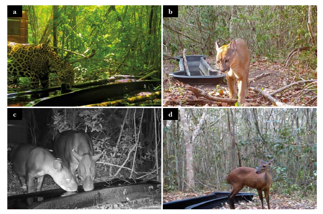
Figure 2 . Jaguars (2a) and pumas (2b) are species of great importance for the Calakmul Biosphere Reserve, along with all herbivores such as tapirs (2c Tapirus bairdii ), and red brocket deer (2d Mazama temama ). All these species benefit from the water supply provided by the drinking troughs.

The number of drinking troughs installed in the CBR was doubled in 2019, as a response to the peak of an intense and prolonged drought recorded in the Calakmul region. In that same year, a high number of sightings of tapirs ( Tapirus bairdii ) in poor physical condition and with dehydration symptoms was registered near or within human settlements (Pérez-Flores et al. , 2021). However, it is likely that the impacts of 2019 were not only caused by the lack of water, but also by the increase in the number of fires in the area (Contreras-Moreno, personal communication).