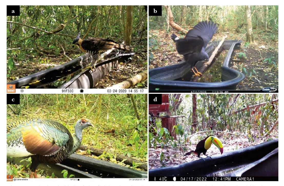
Figure 4 . The jungle birds of the Calakmul region ( e.g. , ornate hawk-eagles (4a) and eagles (4b)) also use artificial drinking troughs, not only for drinking but also as a bathtub. Likewise, tropical birds, such as the ocellated turkey (4c) and the toucan (4d), benefit from the throughs.