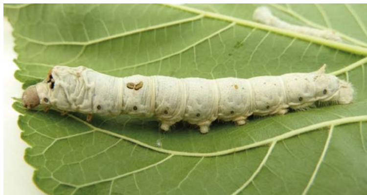
Figure 1. Larva of Bombyx mori L. kinshu×showa hybrid / Chinese×Japanese race.

into five groups. Group 1 was fed with fresh mulberry leaves every day, during the fifth instar, and was considered as the control. Group 2 was fed with mulberry leaves dipped in milk every day, during the fifth instar (Treatment 1: V instar - TD). Group 3 was fed with mulberry leaves dipped in milk on alternate days (1, 3, and 5) of the fifth instar (Treatment 2: V instar - DI); whereas, on days 2, 4, and 6, they were fed with fresh mulberry leaves. Group 4 was fed with mulberry leaves dipped in milk every day, during the fourth and fifth instar (Treatment 3: IV and V instar - TD). Group 5 was fed with mulberry leaves dipped in milk on alternate days (1, 3, and 5) from the fourth to the fifth instar (Treatment 4: IV and V instar - DI); whereas, on days 2, 4, and 6, they were fed with fresh mulberry leaves. Weights were recorded from day 1 to 5. A completely randomized design was used, with three replicates per treatment (with n=50 larvae each). ANOVA assumptions were verified individually for each variable. The independence of experimental errors was ensured through the random assignment of populations to each experimental unit. The assumption of normal distribution was analyzed using the Shapiro-Wilk test. The statistical software used was SPSS v. 25. The “F” value was considered significant at a 0.05 probability level and Tukey’s multiple comparison test was performed at 5%.