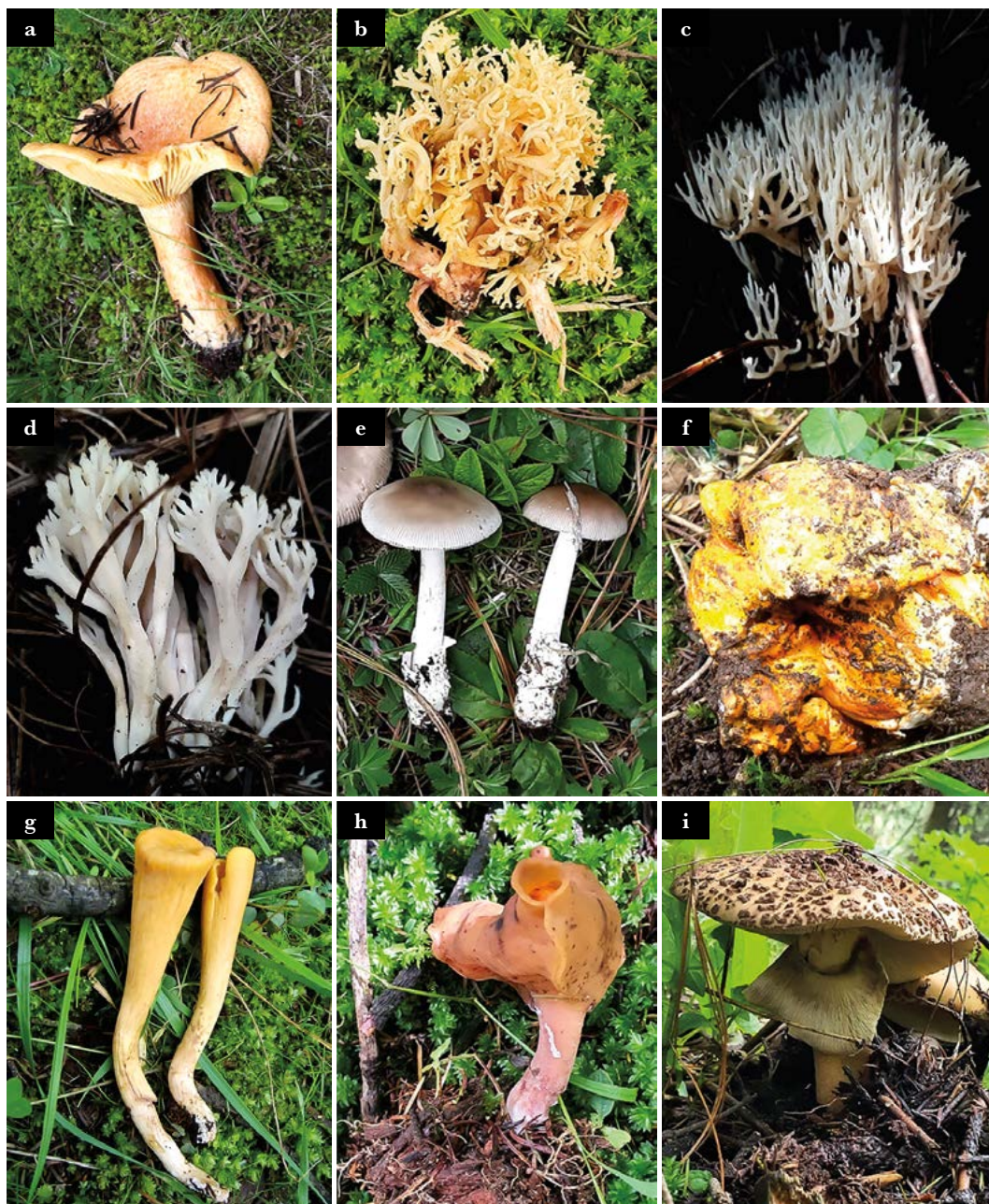
Figure 2. Wild edible mushrooms consumed in Santa Ana Jilotzingo: a) Lactarius deliciosus (enchilado=seasoned with chili); b) Ramaria sp. (patita de pájaro=bird's little leg); c) Phaeoclavulina sp. ("ixlitos"); d) Clavulina cinerea ("ixlitos"); e) Amanita vaginata ("comal"); f) Hypomyces lactifluorum (trompa de cochino=pig's trunk); g) Clavariadelphus truncatus (chichi de vaca=cow udder); h) Gyromitra infula ("chamacuero"); and i) Amanita aff. novinupta ("solis").

represent a greater biocultural abundance than other areas of central Mexico (Domínguez-Romero et al. , 2015; Montoya et al. , 2019). Forty-nine percent of the 99 traditional names documented in Santa Ana Jilotzingo belong to simple primary names given by the shape of some object, such as comales (griddle), panalito (honeycomb), mazorca (corn cob), or