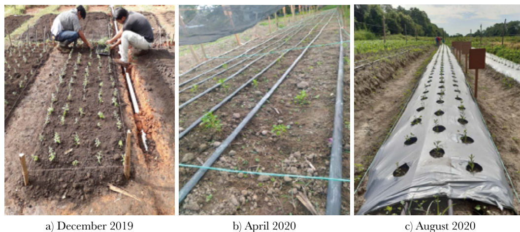
Figure 1. a) Manual preparation of planting beds, irrigation, and manual weeding; b) Soil and mechanized preparation of planting beds, drip irrigation system; and c) manual preparation of planting beds, drip irrigation, silver plastic mulch.

HOBO Data Logger. The monthly precipitation was 36.3 mm, 281.7 mm, and 385.7 mm in the said months, according to the Comisión Nacional del Agua (CONAGUA, 2020). The cultivation area has a soil with a clayey texture, with an OM of 2.3%, pH of 7.9, and an EC of 0.47 dS/cm.