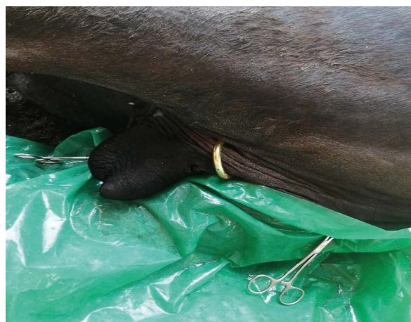
Figure 4. Nasal ring placed on the sigmoid flexure for anatomical fixation.