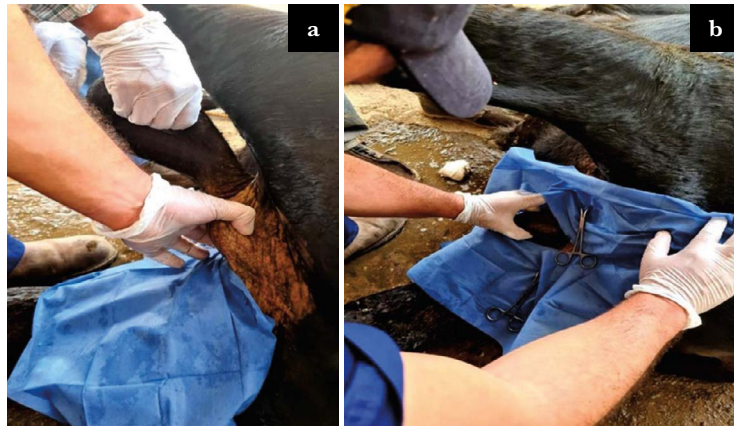
Figure 2. Identification of the sigmoid flexure. a) Palpation of the flexure, where the nasal ring will be inserted; b) placement of surgical drape.