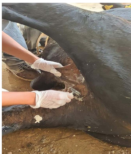
Figure 1. Preparation of the perineum with the animal in the decubitus position.

Sixth stage: Only part of the nasal ring remained exposed. The lateral wounds healed by second intention (Figure 4).