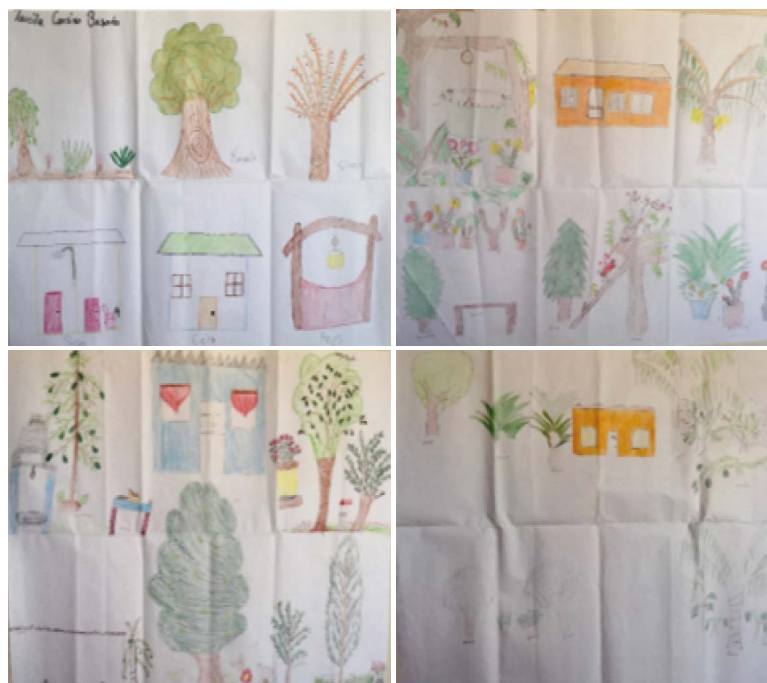
Figure 1. Drawings of the family patio agroecosystem made by the participants.

The design of their patios has aspects that range from emotional wellbeing to satisfaction over having the availability of fresh foods, and the comfort of having their seasoning and medicinal plants accessible. The family patio agroecosystem generates positive emotions such as joy, satisfaction, effort and pleasure which impact their self-esteem directly and positively, by making their own decisions and deciding when and where to plant, which gives them assurance and self-confidence, valuing their being and their doing.