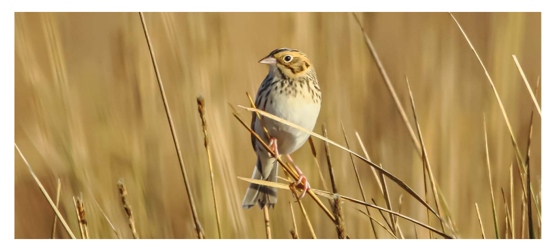
Figure 1. Baird sparrow.

Neural networks are defined as a computational system that imitates the computational capacities of biological systems (Hornik et al. , 1989). For this study the ANN developed by