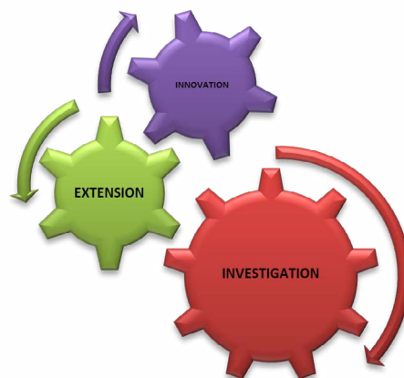
Figure 1. Elements that make up the development strategy of PRODETER.

The Secretaria de Agricultura y Desarrollo Rural (Secretary of Agriculture and Rural Development) defined territorial development as an action where two segments converge: infrastructure investment and knowledge investment. so that farmers, producers, and ranchers (for this document, using any of the three concepts will be considered as synonymous among each other, and differentiates ranchers given the activity they develop)