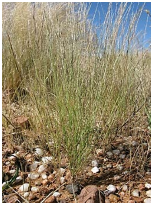
Figure 3. Zacate tres barbas ( Aristida adscensionis ), the most important species in the diet of the bighorn sheep at the UMA Rancho Noche Buena, Hermosillo, Sonora, Mexico.