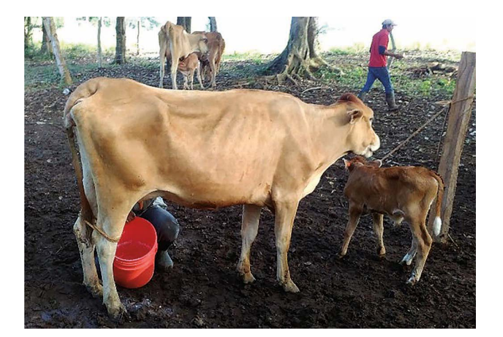
Figure 1 . Criollo Tropical Milking cow hand milking with the presence of the calf in the "El Huilango" land lot, Cotaxtla, Veracruz, Mexico.

The criollo Tropical Milking (LT) race is adapted to shepherding systems, requires little inputs, its productive capacity is 1174±11.4 kg of milk per breastfeeding, reason why it is a gene alternative for