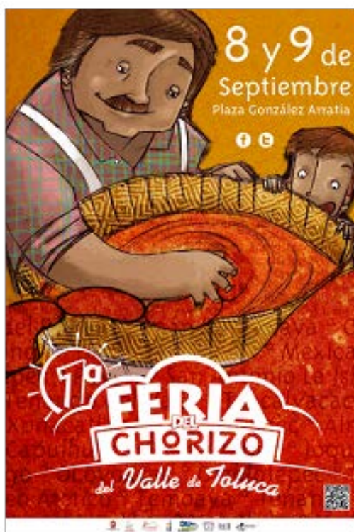
Figure 1. Poster from the fair (Ovando, 2013: 91).