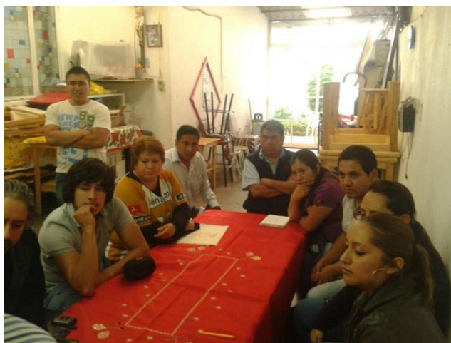
Photo 1. Meetings with producers

However, the proposed name –despite the background– was inviable because within the industrial property law endorsed by the IMPI, in 2012, certain words could not be used, such as Valle (valley), Toluca or chorizo, due to their generic character; this was before the law's actualization –carried out in 2018–