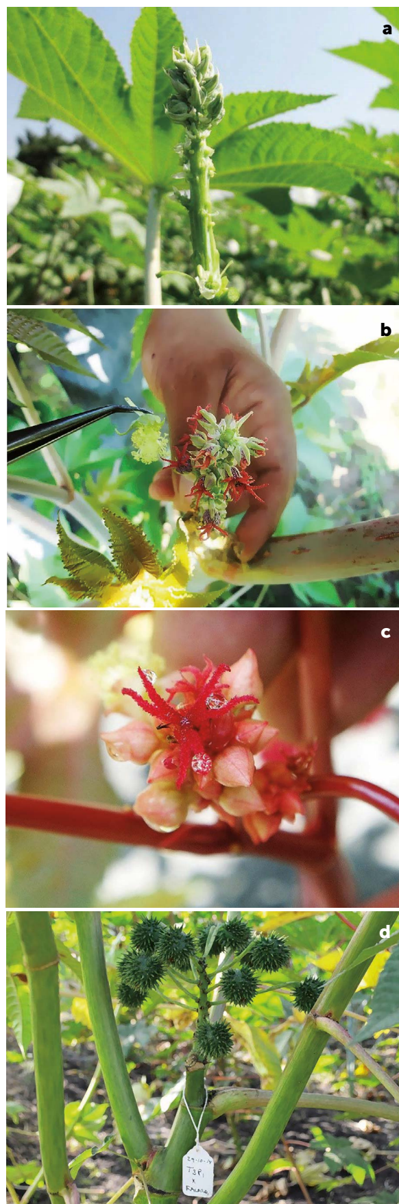
Figure 1. Hybridization process in castor. a) Emasculated inflorescence. b) Manual pollination. c) Receptive stigma. d) Fruit development.

In the year 2014, 400 inflorescences were pollinated, with 8 flowers on average each and fruit pollinated was 61.21%. In 2015, 245 inflorescences were pollinated, with 12 flowers on average and fruit pollinated of 61.24% (Figure 1d).