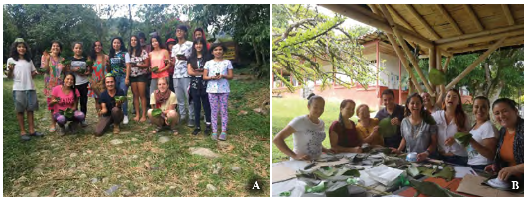
Figure 5. Workshops organized to demonstrate the techniques of elaboration of biodegradable plates from plantain ( Musa spp.) leaves and cassava ( Manihot esculenta ) starch. A) Bosqueschool Cariba, San Carlos, Antioquia, Colombia; B) Association of the Local Tourism Network, San Rafael, Antioquia, Colombia.

Back in Mexico, the same initiative was implemented in Monte Salas. Biodegradable plates were made for a festival, and they served as replacement for disposable plastic or styrofoam materials (Figure 6A). In such biodegradable plates, food was served (Figure 6B) previously taking the sanitation measures, which included the perfect cleaning of the leaf