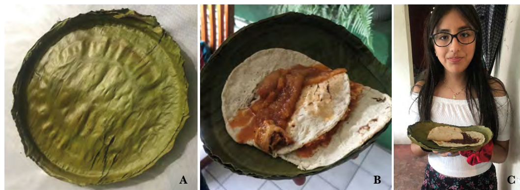
Figure 6. Public demonstration of the biodegradable plates made from plantain ( Musa spp.) leaves and cassava ( Manihot esculenta ) starch in Monte Salas, municipality of Fortún de las Flores, Veracruz, Mexico. A) Prototype of the biodegradable plate; B) Local foods served in the plates; C) People from Monte Salas, consuming local foods served in the biodegradable plates.

to later proceed to the elaboration of the biodegradable plates. The event was attended by people from the town of Monte Salas, who were served in these prototypes that tested their resistance to solid food.