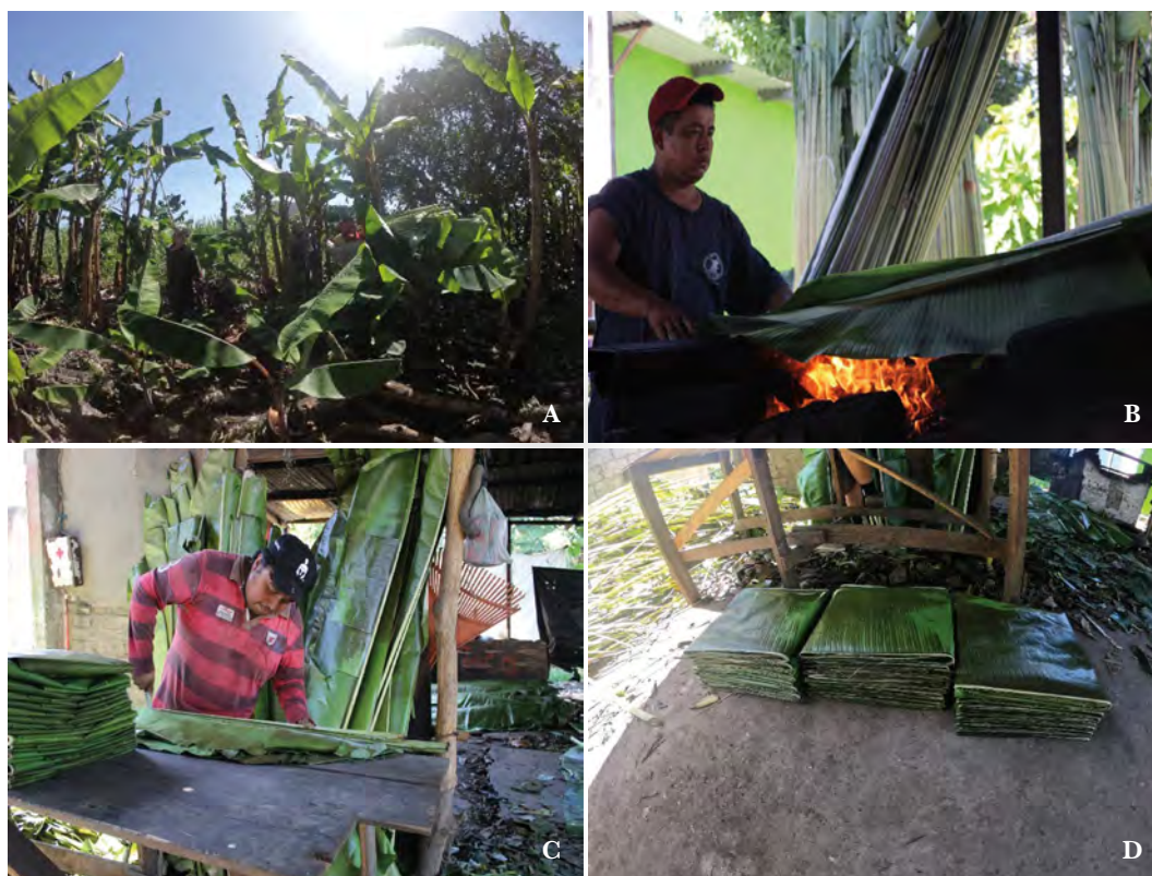
Figure 2. Process of production and manufacturing of plantain ( Musa spp.) leaves to prepare tamales and other regional and local foods in Monte Salas, Fortín de las Flores, Veracruz, Mexico. A) Leaf cutting; B) Leaf roasting; C) Leaf deveining (removing the central vein of leaves); D) Packing.

The cutters are employed by the traders who, through a verbal contract, make agreements with the plantation owners for the cutters to enter their farms to harvest the leaves.