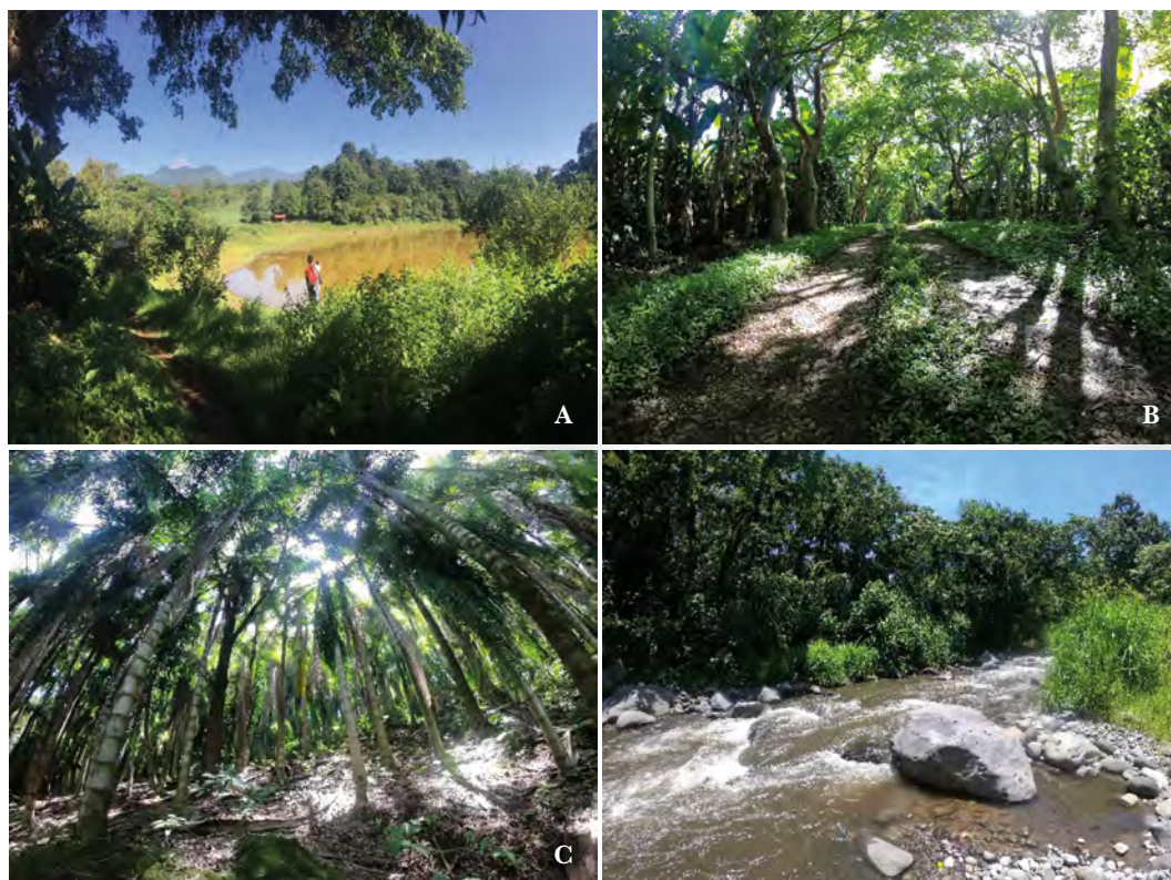
Figure 3. Places with touristic potential in Monte Salas, municipality of Fortún de las Flores, Veracruz, Mexico. 3A) Tule Lagoon. 3B) Road to Tule Lagoon. 3C) Road to Monte Salas river. 3D) Monte Salas river.

Promotional videos were made in order to promote the banana production and leaf processing activities, and thus attract tourism to the area under study. To this end, places with tourist potential such as the Tule Lagoon, which belongs to Monte Blanco (Figure 3A) were visited, a trail towards the plantation where there are different tree species, as well as the banana crop (Figure 3B), a trail of palms that make the landscape attractive (Figure 3B), and the river that runs through the entire Monte Salas ravine. Crops such as chayote ( Secchium edule ), coffee and, of course, banana can be seen along these routes (Figure 3D).