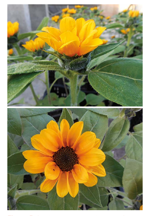
Figure 5. Sunflower cut point 'Vincent Choice Dark Eye'