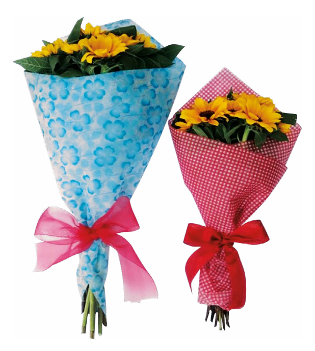
Figure 6. Commercial presentation of the sunflower cut flower.

ornamental sunflowers with similar characteristics to the Vincent Choice were priced at $40.00 MX (US$1.7). However, at the dates of sale, the price was $10.00 MX per ten sunflowers (US$0.40). The strategies used to raise the sale price was to give added value with wrappings and colored ribbons that showcased the sunflowers' color, reaching a price of $50.00 MX (US$2.20) per ten (Figure 6).