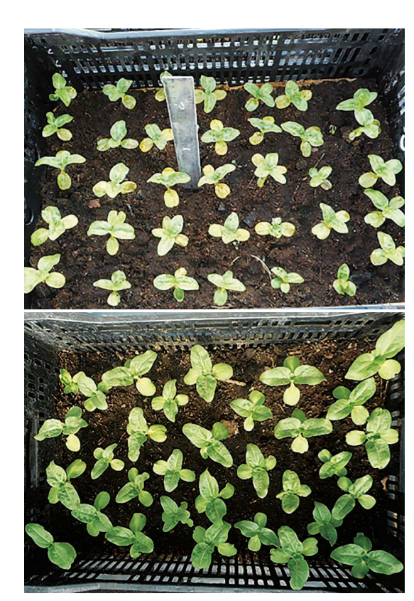
Figure 2 . Sunflower seedlings of 10 days (up) and 21 days (down) germinated in the greenhouse and placed outdoors.

The Vincent Choice Dark Eye Ball<sup>TM</sup> seeds, resistant to low temperatures, were sown in 8 cm of 1:1 peat moss substrate