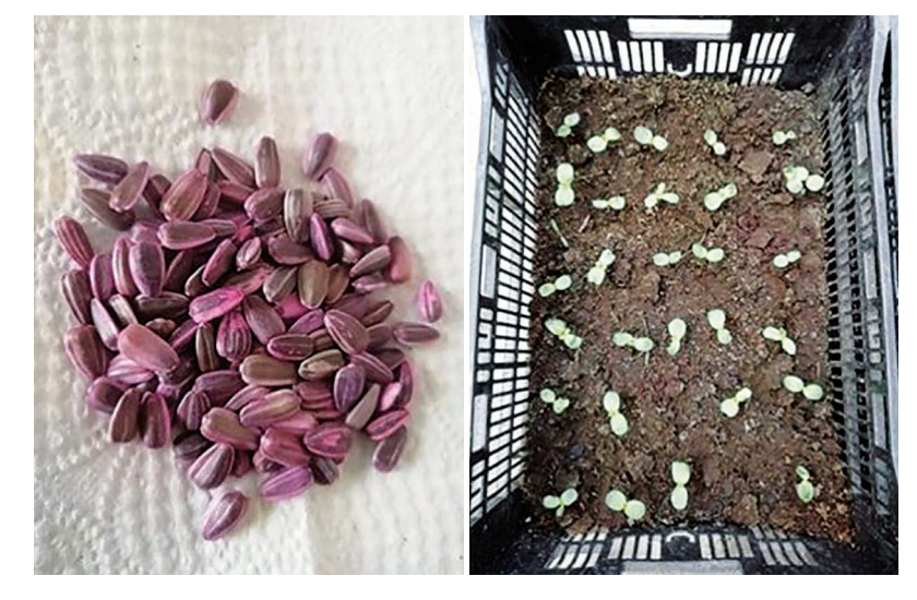
Figure 1. Sunflower seeds and seedlings in black plastic boxes.

million pesos (SIAP, 2018). The production of ornamental sunflower occurs in the states of Baja California, Estado de México, Morelos, Puebla, and Sonora: however, this crop has high production potential in other states in the country, due its capacity to adapt to diverse climates. At a temperature lower than 4 °C, sunflower does not germinate, and therefore in temperate regions it is germinated in greenhouses (Alba and Llanos, 1990). Different sowing dates can cause differences during the development stages of the crop due to ambient temperatures (Baghdadi et al., 2014). Sunflower hybrids require a different amount growing degree-days (GDD) for each of the phenological stages. The most commonly used